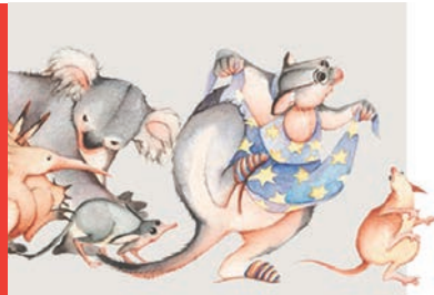
Illustration: Julie Vivas